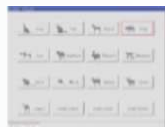
13+3 type of animals