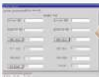
Diff. gain for each animal