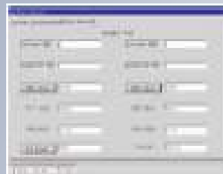
Diff. gain for each animal