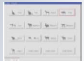
13+3 type of animals